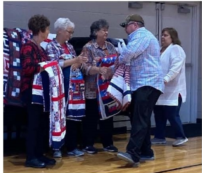
Hancock County Homemakers Club, New Chapel Quilters, presented 19 veterans beautiful patriotic themed quilts at the county's veteran program.

Their dedication to service logged 2,286 volunteer hours last year.