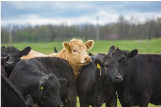
Artificial Insemination is one of the greatest tools producers have to further the genetic potential of their commercial cowherds.