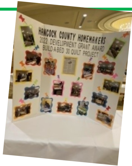
Hancock County Homemakers used the 2022 Development Grant for the Build a Bed Project and made 30 quilts.

At the 2023 KEHA State Meeting they were awarded the grant again and it will be used for the Jr. Wildcat Craft Club.