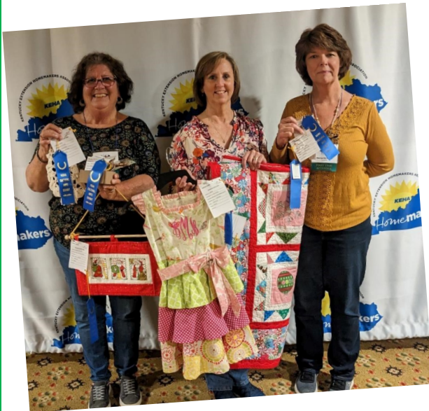
Cultural Arts Blue Ribbon Winners @ KEHA State Meeting

At the 2023 KEHA State Meeting they were awarded the grant again and it will be used for the Jr. Wildcat Craft Club.