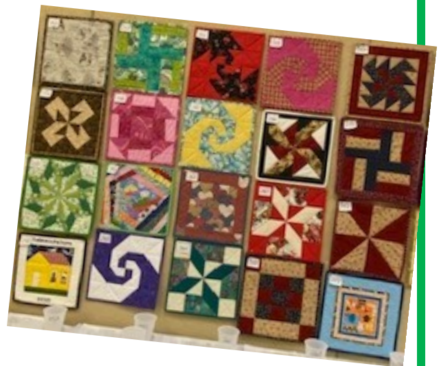
Quilt Squares made by Hancock County Homemakers for the Silent Auction @ KEHA Annual Meeting.